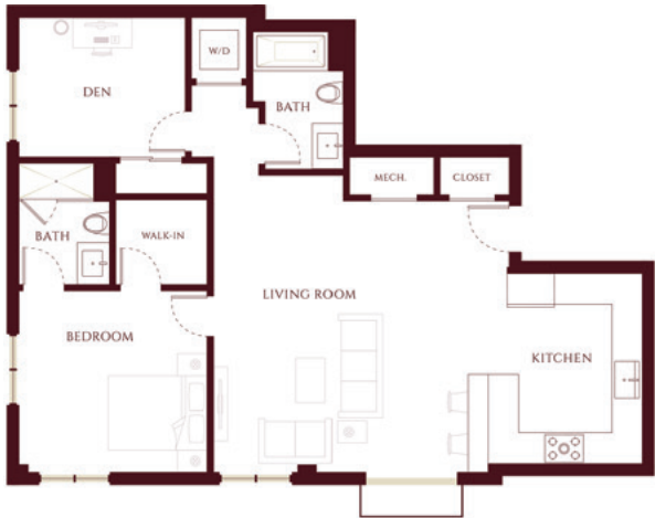
ONE BEDROOM UNIT 6-A