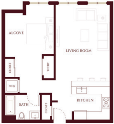
STUDIO UNIT 3-C