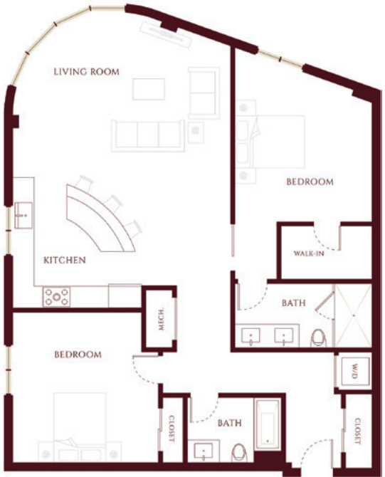
TWO BEDROOM UNIT 9-D