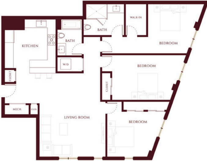
THREE BEDROOM UNIT 14-D