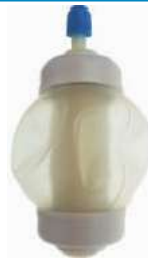
Image of an EMPTY pump

At the end of the prescribed infusion time the inner membrane will completely deflate and the soft outer cover will collapse.