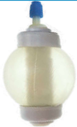
Image of a FULL pump

At the beginning of infusion the inner membrane and soft outer cover will be taut, the pump will be round and firm.