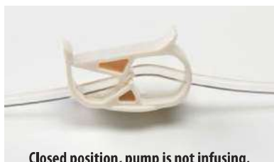
Closed position, pump is not infusing.