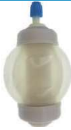
Image of a pump DURING infusion

During infusion the inner membrane will decrease in size and the outer soft cover will begin to form wrinkles.