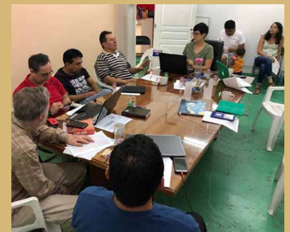
GT Latin America leaders at the Face-to-Face meeting in Central Mexico

Since Global Teams Latin America covers such a vast area – the Central Mexico base is 4,500 miles from the Chilean base – getting the team together for a face to face meeting to pray and plan was an invaluable opportunity that we could not have done without you!