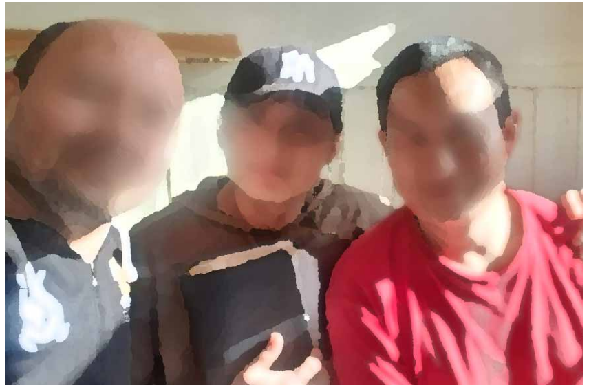
More followers of Christ!

With your gift you are partnering with an international mission movement focused on sharing the love of Christ.