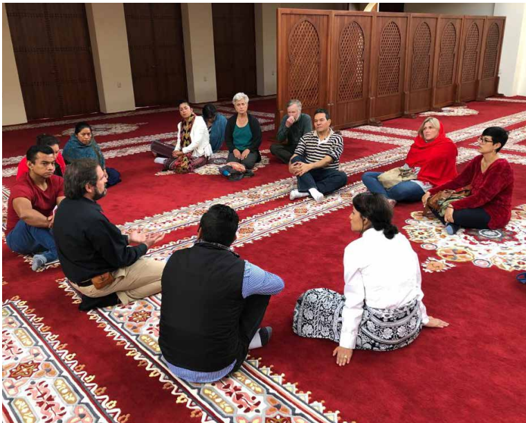
Visiting the mosque in Chiapas

In Chiapas, Mexico, there is a newly built mosque. The imam is a Sufi missionary from Spain and the converts are from the local indigenous population. They are four hundred strong and growing in this historical bastion of Catholicism.