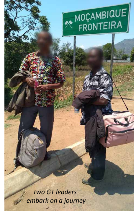
Two GT leaders embark on a journey