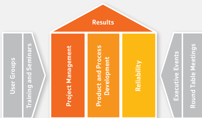
The Holland Innovative House : ■ ■ ■ core ■ results ■ enablers