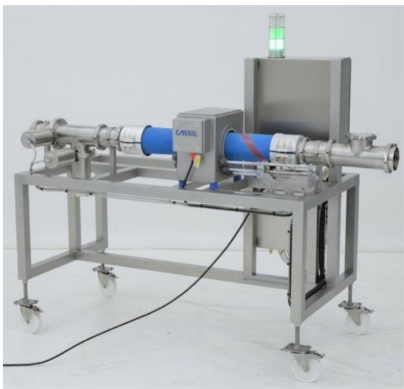
METAL SHARK® IN LIQUID in a mobile frame for use at several locations