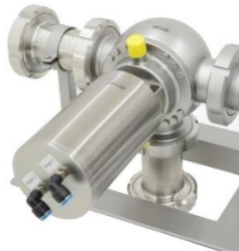
Arc valve EX-BOG