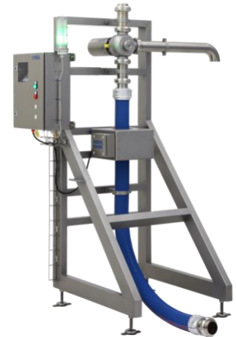
METAL SHARK® IN LIQUID in a mounting frame