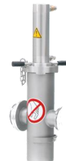
Piston valve EX-PWC