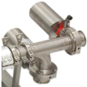
Butterfly-/Shim valve EX-BF

Three different valve types, optimally matched to the respective product, guarantee reliable discharge of metallic contaminants. All valves can be CIP cleaned.