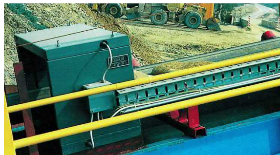
Metal detector SQTA – tandem version.

For a higher belt speed (M10 nuts) at a belt speed of max. 4.0 m/s we recommend the metal detectors SQ and SQTA.