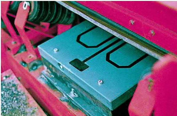
Metalldetektor SQ als Einzelsonde unter dem Förderband montiert.