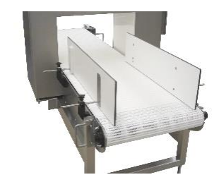
Side rails for for particularly high products