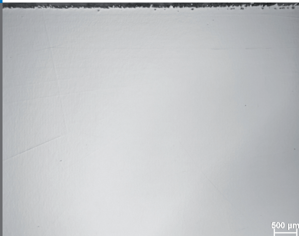
Test piece (x 20 magnification)