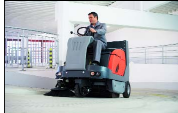
Great for use in indoor or outdoor applications because of the option to choose gas, diesel or battery operated.

Once the 34 gallon dirt hopper is full, the 60" high-dump hopper makes for easy emptying into larger containers. The hopper can be used to the full capacity because of the lifting power of the high-dump hopper.