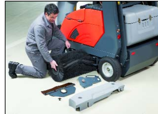
Change-out of main sweeping brush requires no tools and is quick and simple.