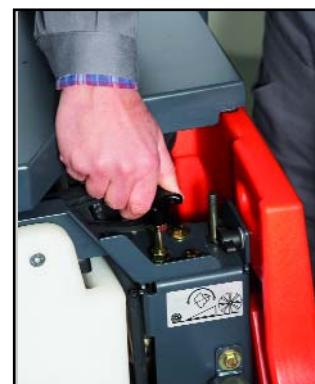
The control for the large dirt flap allows the operator to pick up large items during the course of sweeping.