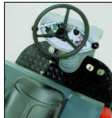
The simple design of the operator controls means less operator error.