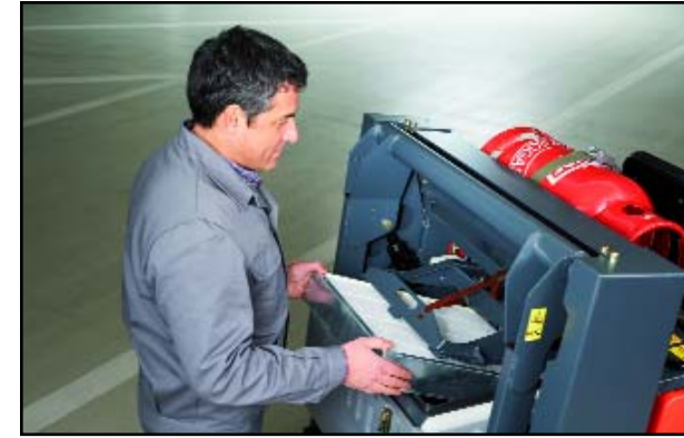
Easily accessible high performance filter system ensures clean exhaust air.