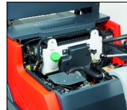
The engine compartment provides easy access for maintenance and service.