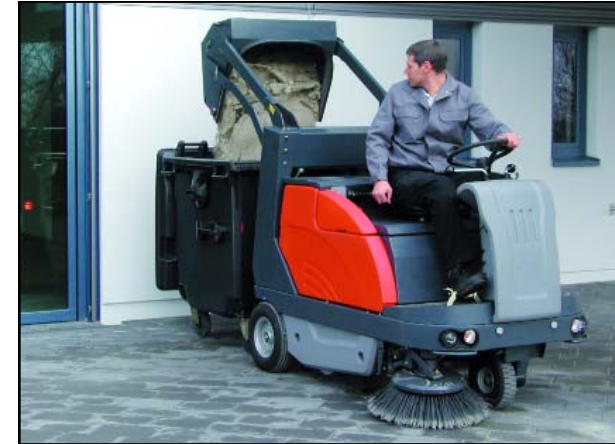
The high dump hopper can be easily emptied into large containers.