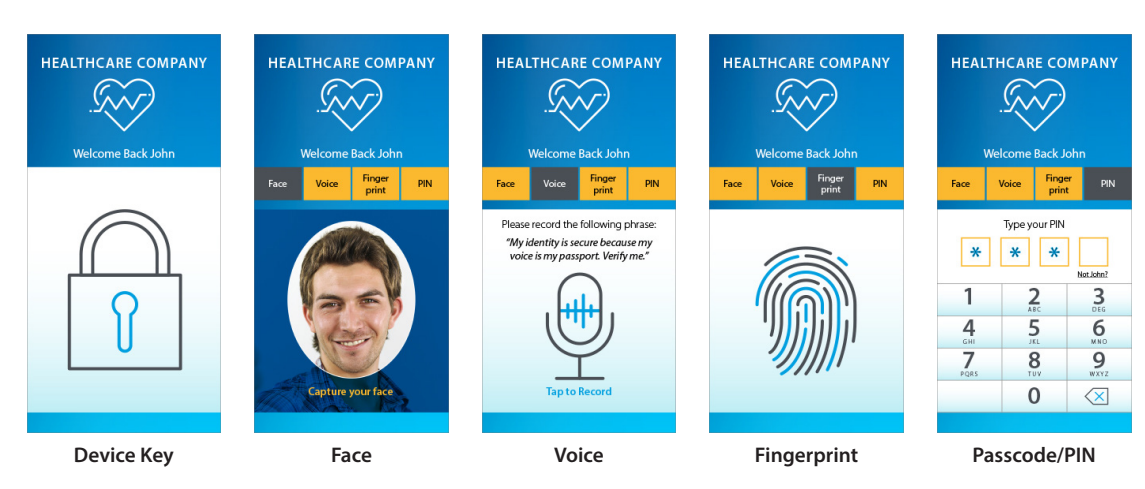
Worried about future-proofing?

In addition to identifying the registered user, IdentityX uses the smartphone's geolocation capabilities (GPS) to bind a permanent timestamp and location to each authentication event.