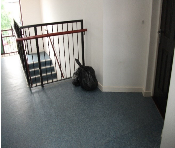
1 st floor landing