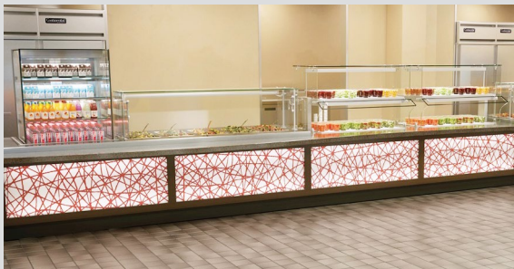
Image of Coppell Middle School with SELECTLINE counter and VISIONDESIGN back-lit front panel graphics.

We've made it easy for you to choose the serving counter solution that's perfect for your school's dining facility. From standard modular offerings to more personalized options with flexible materials and configurations, LTI is your single source from design to installation.