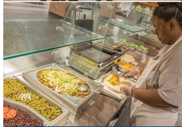
Consultant, Designer and Architect: Buckley & Associates