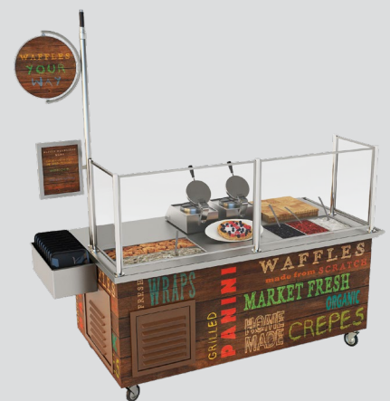
Prepare waffles and serve fresh to students.