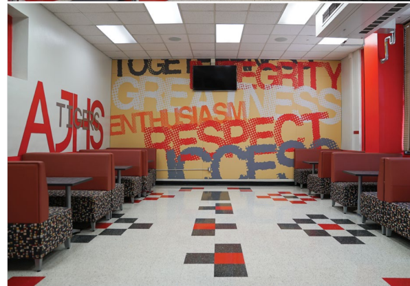
Architects: Bhide & Hall Architects