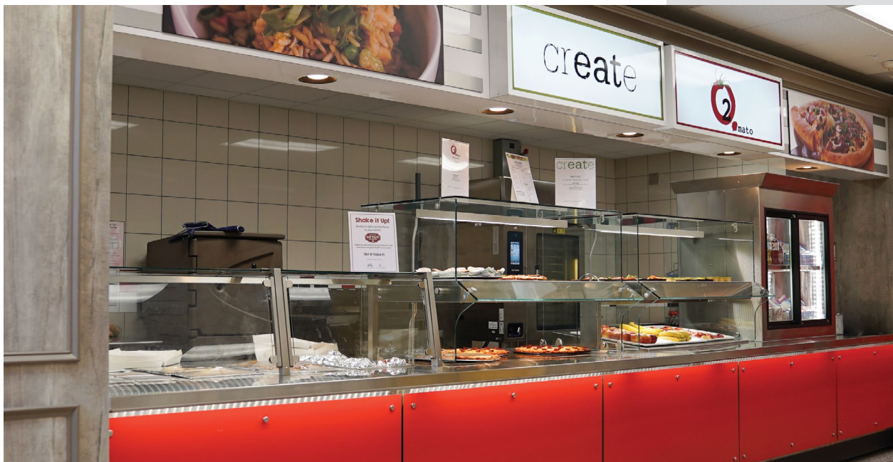
Soffits and signage to create a food court look.