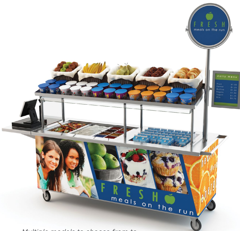
Multiple models to choose from to serve quick foods and breakfast items.

From a quick, convenient breakfast to lunch on the go, LTI's Grab 'N Go carts are perfect for multiple applications wherever and whenever you need an extra point of service. Simply stock a cart with product and wheel it where it's needed. LTI's carts are extremely durable, versatile and built to last — and because they're constructed from molded fiberglass and stainless steel, they're always easy to clean and last longer than plastic or laminated units.