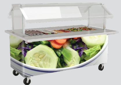
Fresh 'N Ready Food Bar is a great way to serve nutritious chilled foods to students.