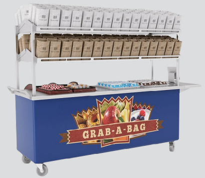
Grab-a-Bag cart helps efficiently move students through serving areas.