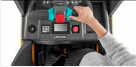
ERC storage controls and compartment