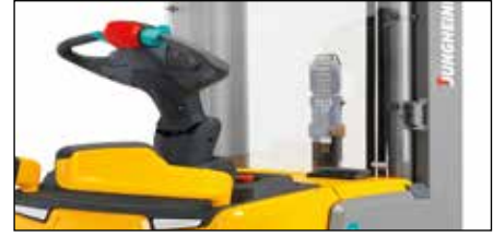
Easy-to-operate main connector for on-board charger