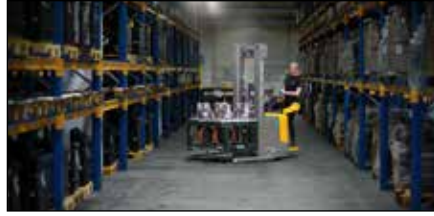
ERC operator position