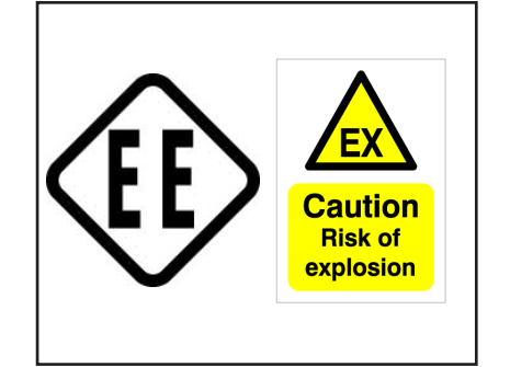
EE and EX Classifications Optional