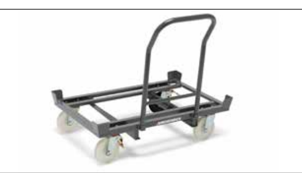
Optional handle bar for increased height