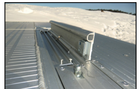
Cart Stops provide an additional safety precaution. This feature will prove to be useful in protecting your cargo from sliding off the platform.