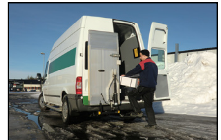
WHZ hinged platform in a closed position to allow access to rear door.