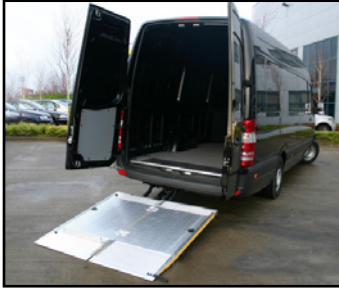
WHZ open and unloaded.

Notice below, the added convenience of being able to unload heavy, large loads, as well as gain access to the rear door for smaller, light deliveries.