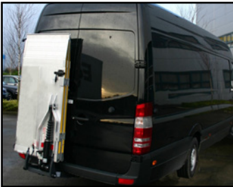
WHZ in stowed position, allowing driver access to rear door.