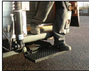
Dedicated footstep for added safety.

*Eligible for Waltco's Quick-Lift Program (see details below)