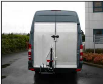
WHZ open and stowed for multiple large cargo deliveries.