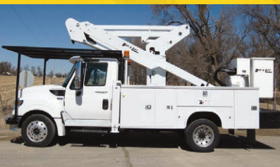
DTAX-44 SHOWN WITH 11' BODY.

Working heights up to 49 FEET AND SIDE REACH UP TO 30 FEET