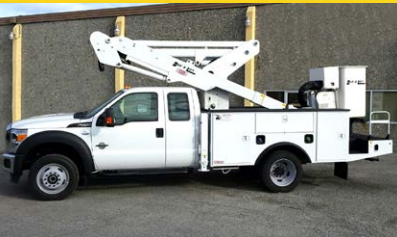
DTAX-42 SHOWN WITH 9' BODY.