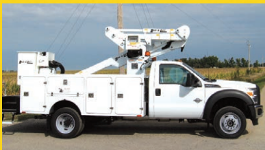
DTAX-39 SHOWN WITH 11' BODY.