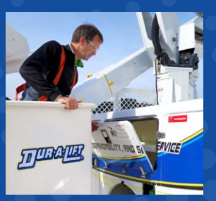
Convenient access to all the storage compartments right from the basket.

The hydraulically activated basket elevator allows the operator to raise the basket 22" without repositioning the booms or the jib.