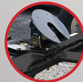
FIFTH WHEEL ATTACHMENT (OPTION)