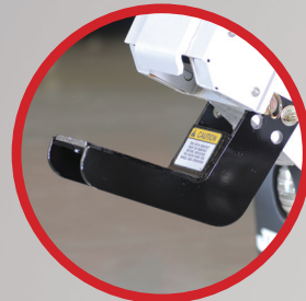
BALL HITCH ATTACHMENT