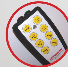
WIRELESS REMOTE CONTROL (OPTION)