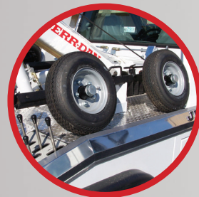
TOW DOLLY WITH STORAGE BRACKET (OPTION)