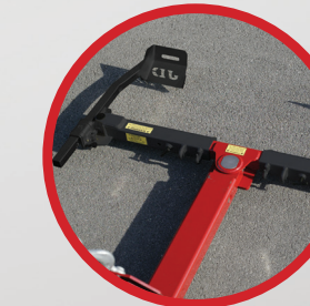
PIVOTING MANUAL L-ARM (OPTION)