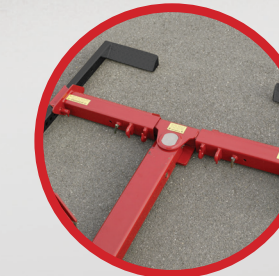
MANUAL L-ARM (OPTION)