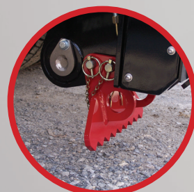
SPADE FOOT ATTACHMENT (OPTION)