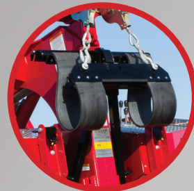
TOW SLING (OPTION)

A corrosion-resistant modular aluminum body is built for a long working life, and Jerr-Dan's exclusive No-Lube™ technology reduces maintenance, saving time and money.