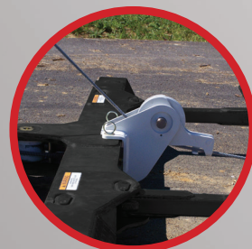
RECOVERY SHEAVE (OPTION)