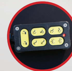
MEMBRANE REMOTE CONTROL