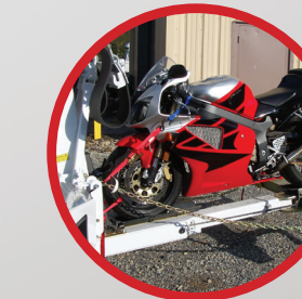
MOTORCYCLE ATTACHMENT (OPTION)