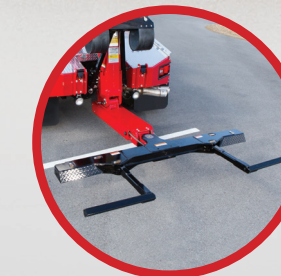
HYDRAULIC SELF- LOADER (OPTION)