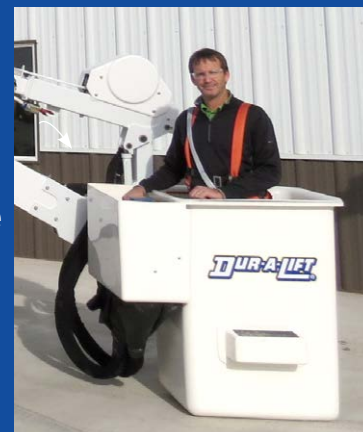
GROUND ACCESS FROM BASKET