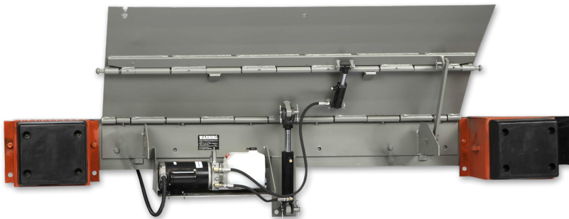
*Mechanical edge-of-dock leveler shown with heavy duty bumpers