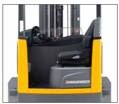
Five different steering modes