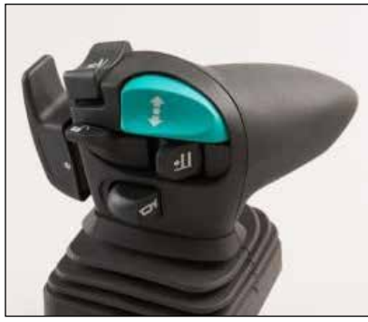
multiPILOT control (optional)

All the controls are within the operator's field of vision and are clearly designated for each specific function.