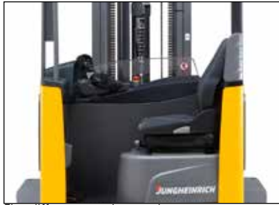
Five different steering modes