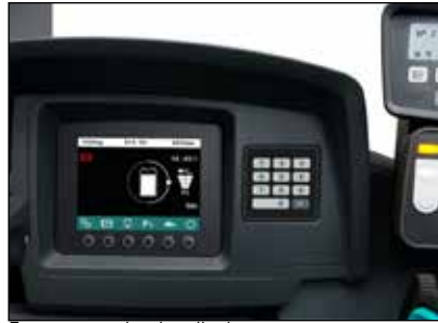
Easy-to-read color display