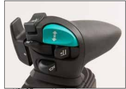
multiPILOT control (optional)