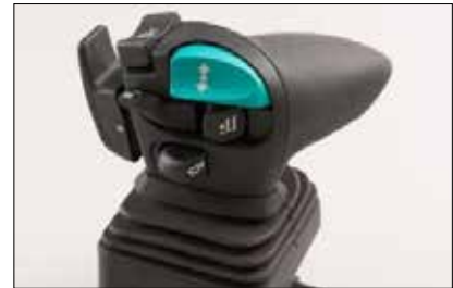
multiPILOT hydraulic control (optional)