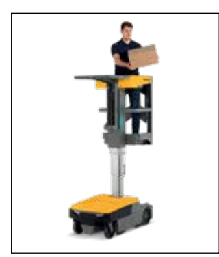
Stable even at full height