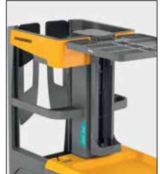
Controls and storage tray in view at all times