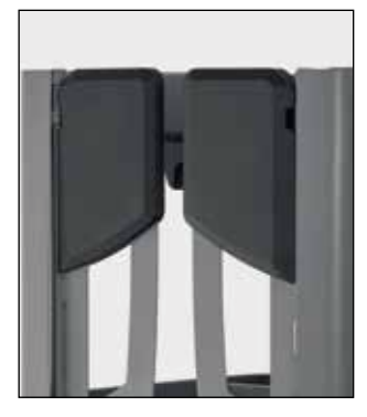
Padded doors for easy entry and operator comfort