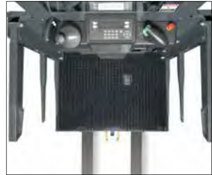
Ergonomic operator compartment