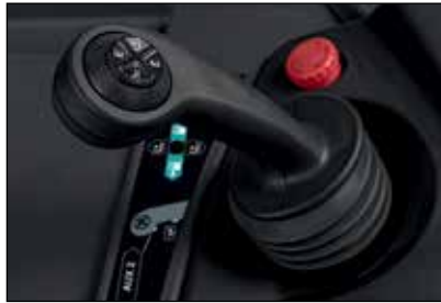
Multifunction Control Handle