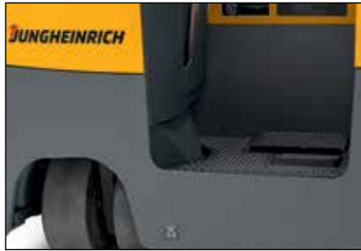
Anti-Fatigue Suspended Floorboard

Capable of handling maximum load capacities while remaining exceptionally maneuverable, the stand-up counterbalance is designed for extensive shuttling, frequent entering and exiting of trailers and tight turns in narrow spaces. The large, dual drive tires are independently controlled for improved lift truck maneuvering.