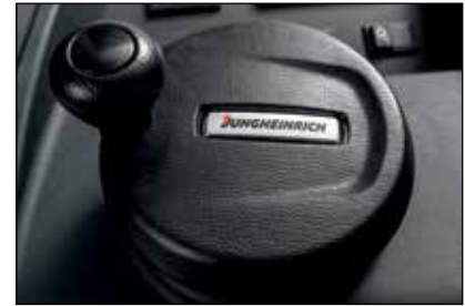
Low-effort Electric Power Steering

Performance profiling allows you to customize drive and hydraulic settings based on the specific application, individual operator experience level and personal preferences. All performance requests, information queries and display-based programming can be performed with easily accessible buttons.