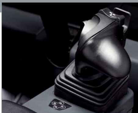
Optional joystick control

The standard fingertip hydraulic controls are integrated into the armrest and offer low-effort, precise control. The travel direction switch and horn are integrated into the module for simultaneous functionality. Joystick control is available as an option.