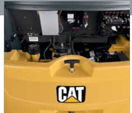
Service time is minimized