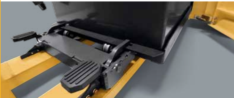
Manual Pallet Jack Extraction with SnapFit