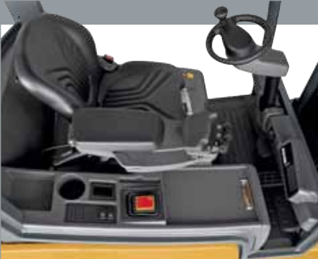
Spacious operator compartment

The floating cab rests on cushioning bushings, working with the full-suspension seat to absorb floor shocks and overall vibration. The narrow steer column adjusts for height and proximity, resulting in additional legroom, while the AC steer system provides low-effort, responsive steer control.