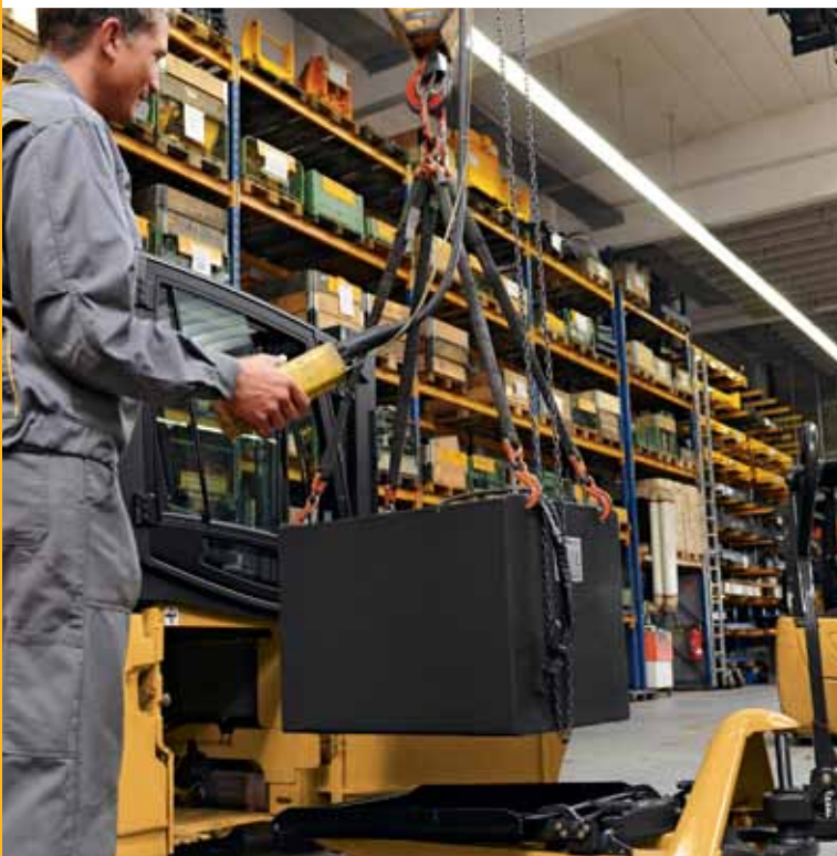
Crane Extraction with SnapFit