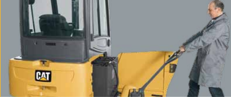
Battery Access for maintenance (standard equipment)

The EPC3000-EP4000 Series of lift trucks provides several convenient battery access and extraction alternatives for you to choose from based on your application needs.