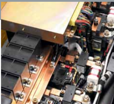
Parts when you need them

Financing your next Cat lift truck is easy with our wide range of flexible leasing and purchasing options. Whether you want to finance or lease, your local Cat lift truck dealer can help customize a package tailored to your specific needs.