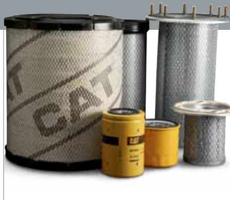
Genuine Cat Lift Truck OEM parts