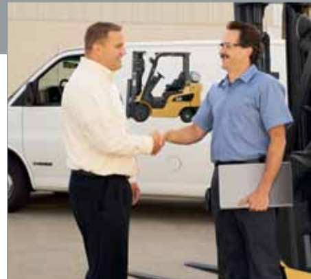
Custom financing packages

* Programs may be subject to change without notice and may vary by region. Please ask your local Cat lift truck dealer for complete terms and conditions.