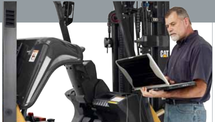
Keeping you covered

We deliver peace of mind by helping your trucks stay on the job, day after day. Every new Cat lift truck is covered by a 1-year/2,000 hours warranty that includes parts and labor, as well as components and systems. With our standard 2-year/4,000 hours extended powertrain warranty, you'll have the confidence that only comes from owning a Cat lift truck.