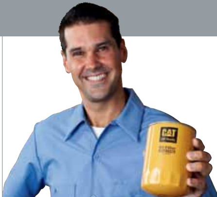
Professionals you can depend on

With hundreds of dealer locations throughout North and South America, Cat lift truck dealers provide more than lift trucks. From flexible financing options, to parts, service and product support, our dealers are unsurpassed.