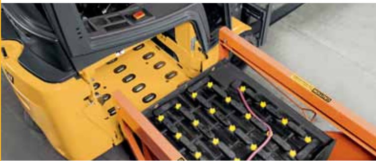
Roller Bed Extraction