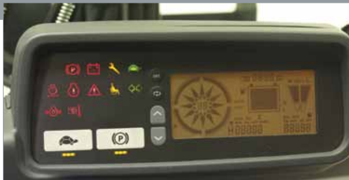
Optimized display panel raises awareness

The easy-to-read, cowl-mounted display includes a steer direction indicator, maintenance reminders and selectable performance modes which provide considerable adjustments to the drive and hydraulic functions to meet operator requirements.