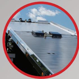
LOW PROFILE WINCH SYSTEM ALLOWS FLAT ALIGNMENT OF UPPER AND LOWER DECK