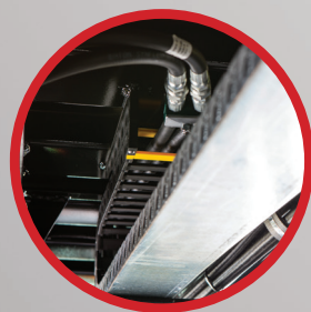
DUAL HOSE TRACKING SYSTEM