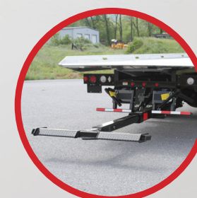
WHEEL LIFT SYSTEM (OPTIONAL)