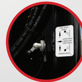
UPPER DECK WINCH AIR FREE SPOOL (STANDARD)