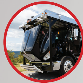
3-RUNG FOLD AWAY STEP LADDER ON THE FRONT STRUCTURE