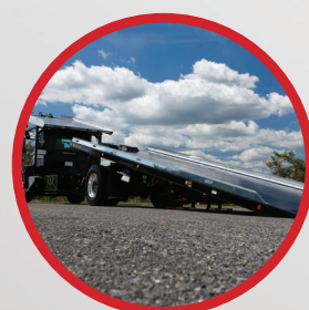
EFFICIENT LOAD/UNLOAD ANGLE AND VEHICLE ACCESS