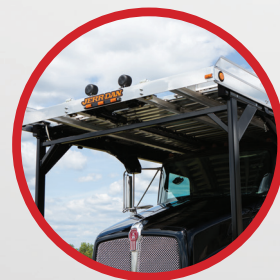
ALUMINUM UPPER DECK IS STRONG, DURABLE AND LIGHTWEIGHT