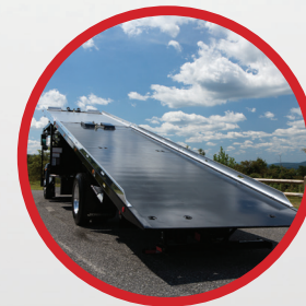
KEY SLOTS (STRAIGHT "T", "X" AND ANGLED "T")