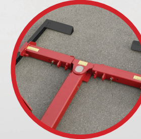
MANUAL L-ARM (OPTION)