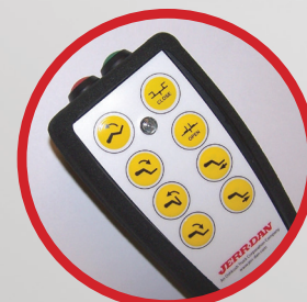
WIRELESS REMOTE CONTROL (OPTION)