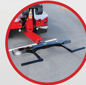
HYDRAULIC SELF-LOADER (OPTION)