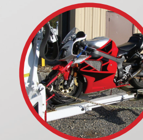
MOTORCYCLE ATTACHMENT (OPTION)