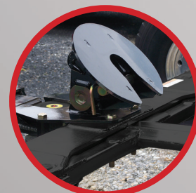
FIFTH WHEEL ATTACHMENT (OPTION)