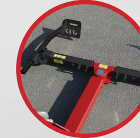
PIVOTING MANUAL L-ARM (OPTION)