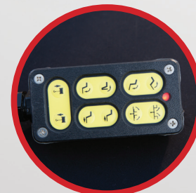
MEMBRANE REMOTE CONTROL