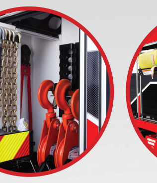
TILT-DOWN DRAWER, CHAIN CAROUSEL, CHAIN BINDER & STAY-DRY STORAGE