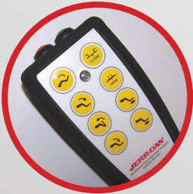
WIRELESS REMOTE CONTROL (OPTION)