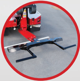
HYDRAULIC SELF- LOADER (OPTION)