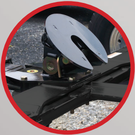
FIFTH WHEEL ATTACHMENT (OPTION)