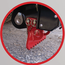
SPADE FOOT ATTACHMENT (OPTION)