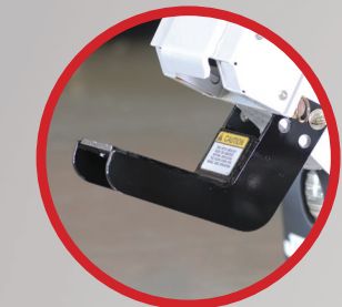
BALL HITCH ATTACHMENT (OPTION)

A corrosion-resistant modular aluminum body is built for a long working life, and Jerr-Dan's exclusive No-Lube™ technology reduces maintenance, saving time and money.