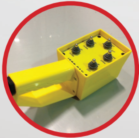
TOGGLE BOX CONTROL (OPTION)