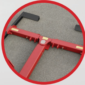
MANUAL L-ARM (OPTION)