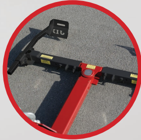
PIVOTING MANUAL L-ARM (OPTION)