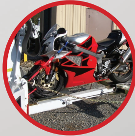
MOTORCYCLE ATTACHMENT (OPTION)