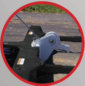
RECOVERY SHEAVE (OPTION)