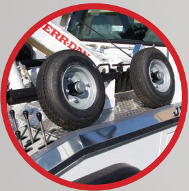
TOW DOLLY WITH STORAGE BRACKET (OPTION)