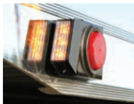
Side-mounting helps to minimize potential blockage from payloads