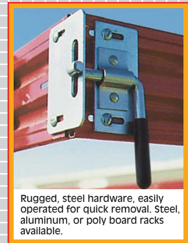
Rugged, steel hardware, easily operated for quick removal. Steel, aluminum, or poly board racks available.