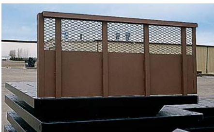
42" bulkheads with mesh windows are optional for both Fleet and Standard platforms. Fleet uses stake pockets; Standard welds to platform frame.