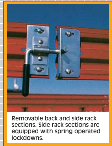
Removable back and side rack sections. Side rack sections are equipped with spring operated lockdowns.