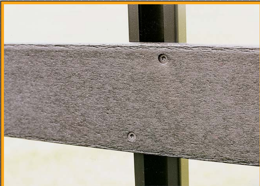
1" x 5½" Solid Core, Poly Board Slats are manufactured from 100% recycled polyethylene with a "wood grain" look. Slats will not rust or rot and never need painting. Standard color is solid black. Poly board slats are resistant to chemicals, water and salt.