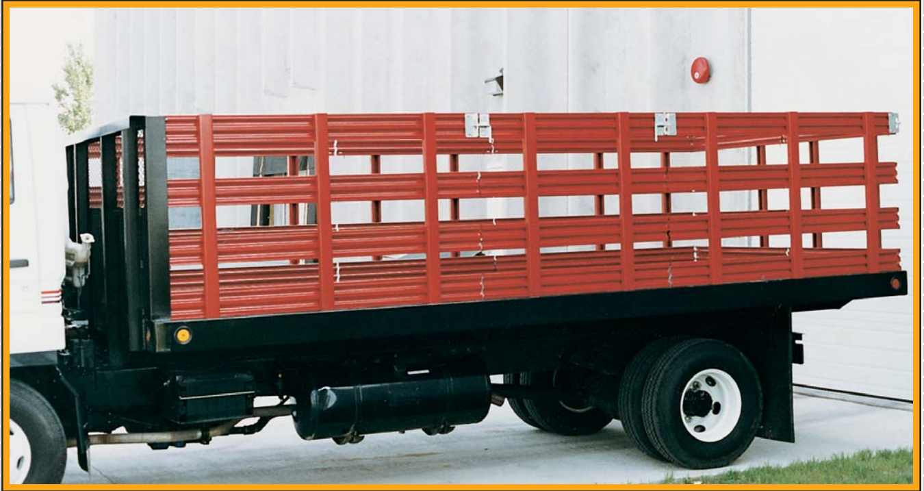
STEEL PAINTED RACKS

STEEL PAINTED RACKS • ALUMINUM RACKS • POLY BOARD RACKS