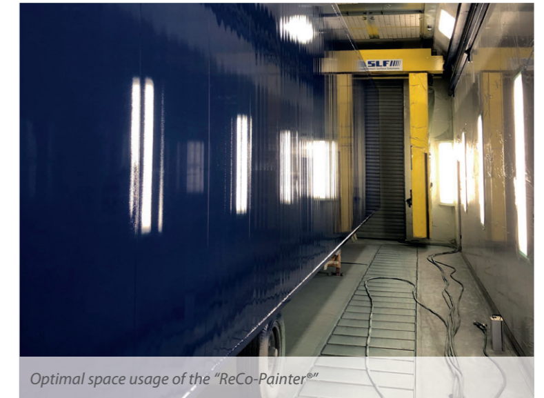
Optimal space usage of the “ReCo-Painter®”