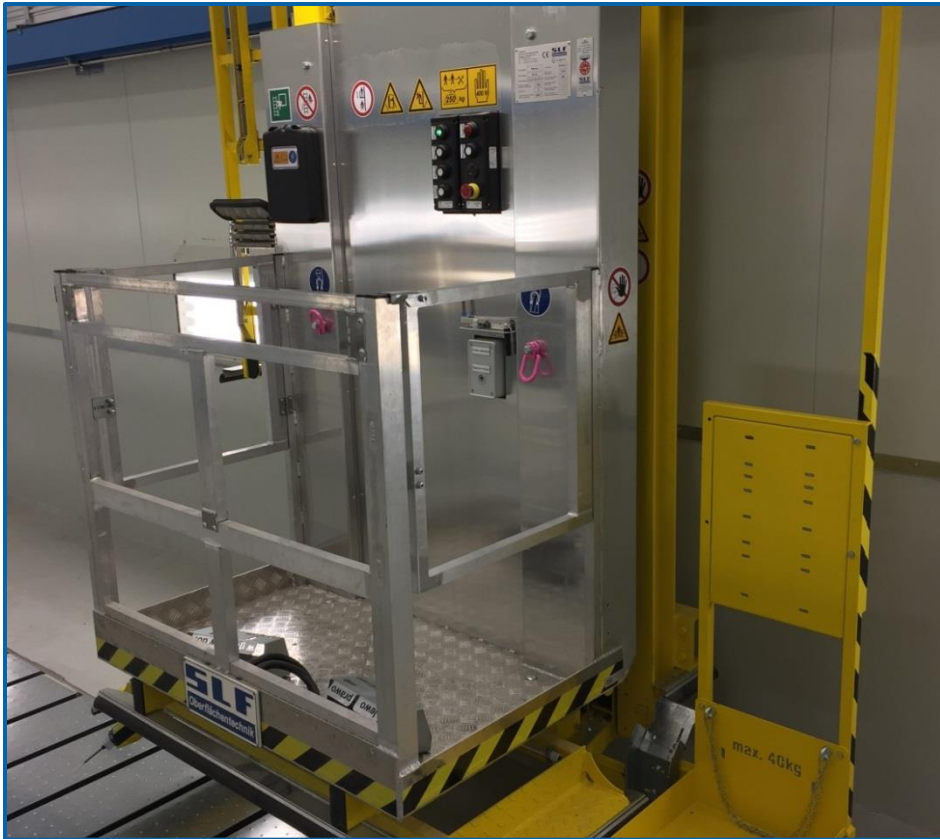
SLF scissor-type lifting platform with storage tray for paint drum in a combined paint spraying and drying booth