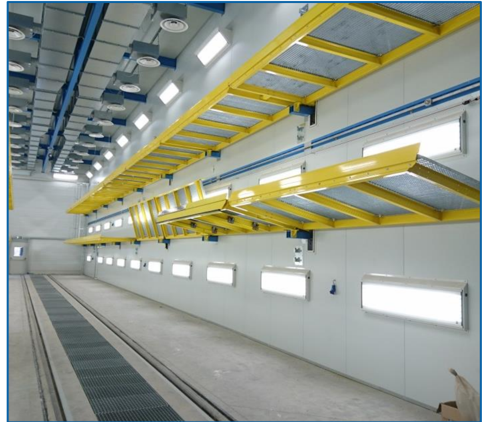
Folding platforms with two working levels in a filling and grinding booth