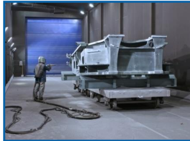
Blasting of machine frames