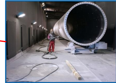
Blasting of wind towers