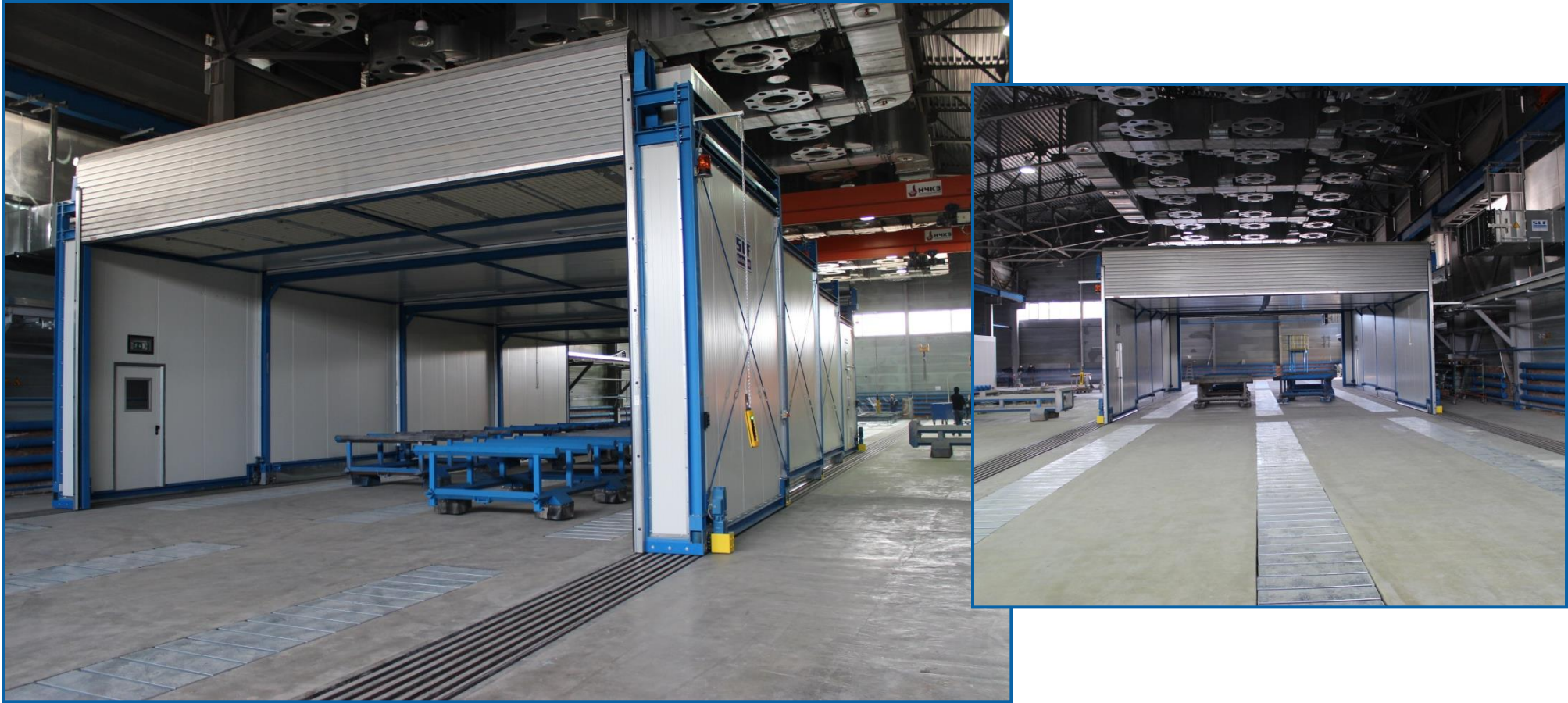
Open-space paint spraying system with telescopic drying tunnel