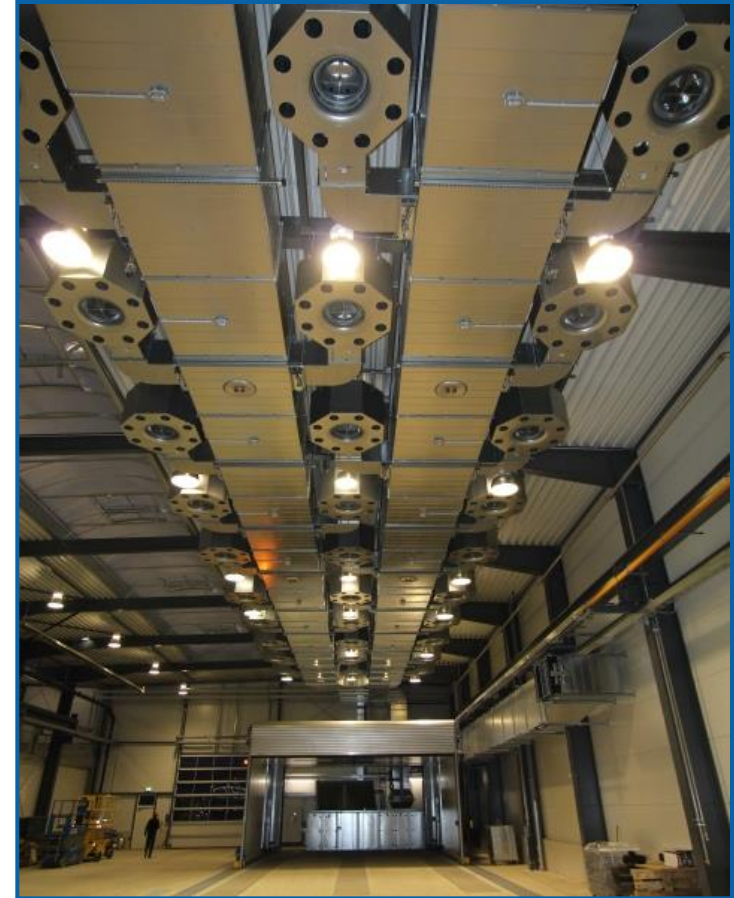
Alternating parallel paint spraying and drying