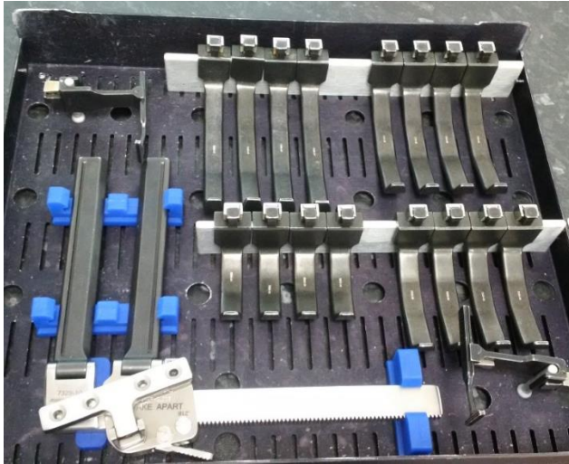
Retractor set laid out in its Container