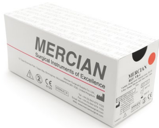
Supplied sterile in boxes of 12 pieces

The material has a none reflective surface eliminating distractions from theatre lighting and has a non-tacky finish to aid mobilisation of the Vessel.