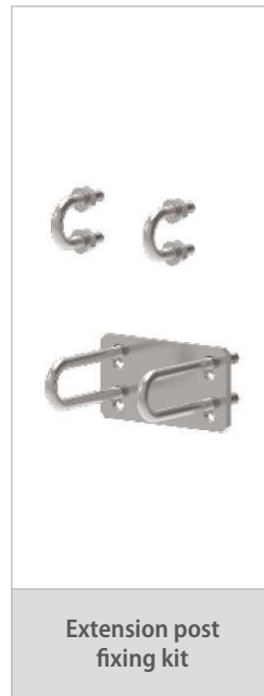
Extension post fixing kit