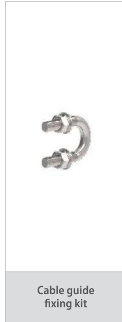
Cable guide fixing kit