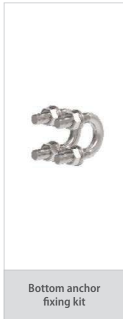
Bottom anchor fixing kit