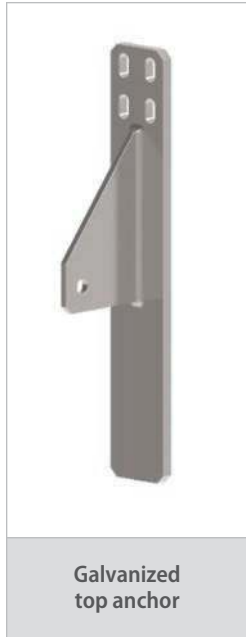
Galvanized top anchor