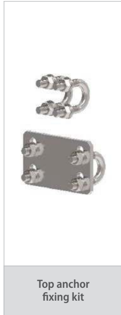
Top anchor fixing kit