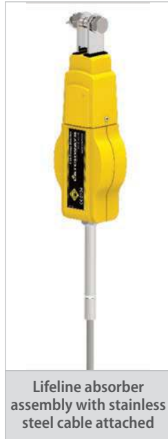
Lifeline absorber assembly with stainless steel cable attached