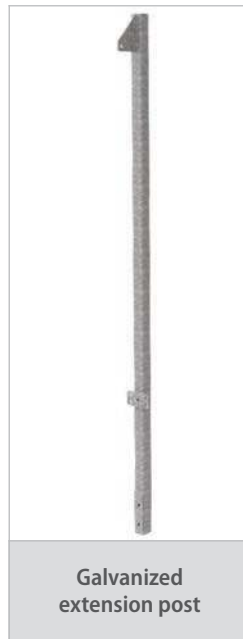
Galvanized extension post