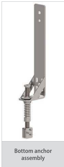
Bottom anchor assembly