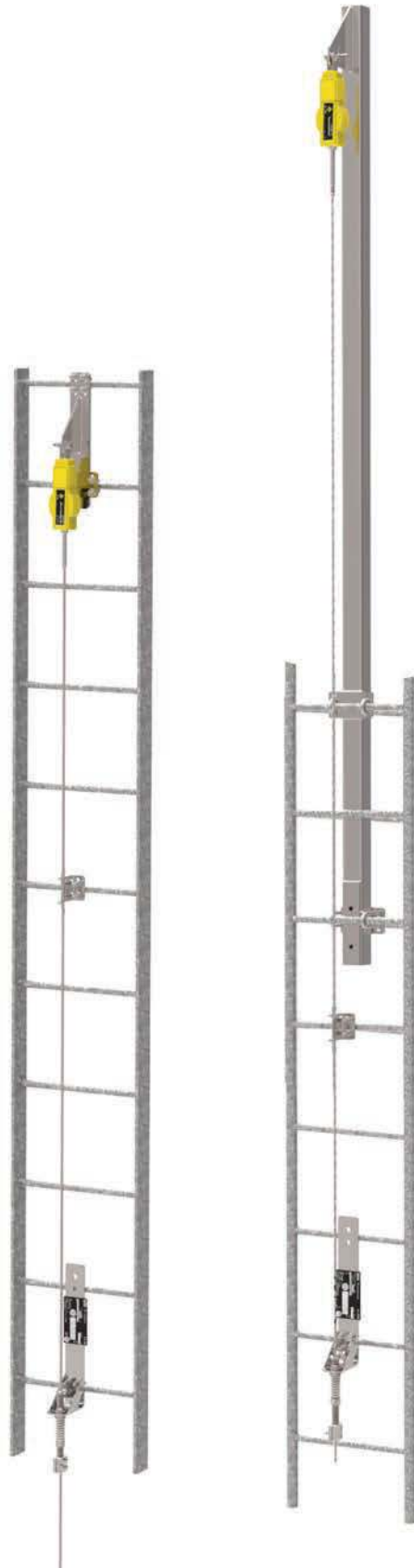
Vertical ladder system