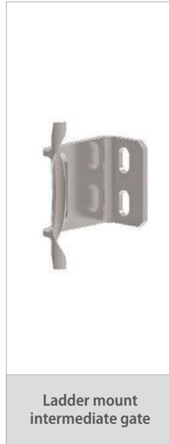
Ladder mount intermediate gate