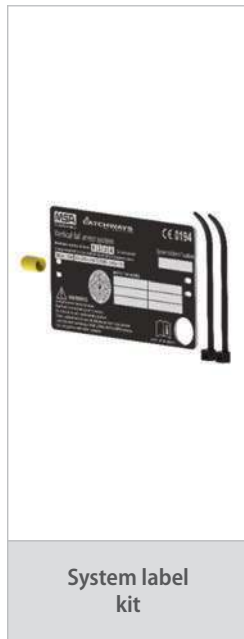
System label kit