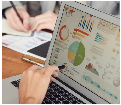
Design & Operationalize Your Culture

Limitless opportunities for learning & sharing. You'll get access to mentors, proven methods, tools, office hours and more!