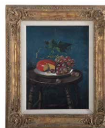
Joseph Sheppard. "Still Life with Grapes," oil (American, b. 1930). Oil on masonite, signed "Sheppard" ur, sight size: 15 1/2 x 11 1/2 in., framed. Est. $ 800 - 1,200 Provenance: From the Estate of Jack Luskin, Baltimore, MD.