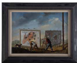
Joseph Sheppard. "Vandals Destroying Billboards" (American, b. 1930). Oil on masonite, signed "Sheppard" ll, sight size: 11 1/2 x 15 1/2 in., framed. Est. $1,000 - 2,000 Provenance: From the Estate of Jack Luskin, Baltimore, MD.