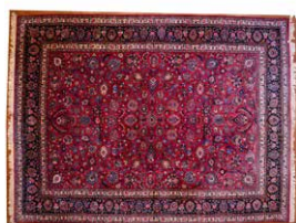
Meshed Carpet, Persia, 11.7 x 15.4 Third quarter-20th century; hand-knotted, wool pile on cotton foundation. Est. $1,000 - 2,000 Provenance: From the Estate of Jack Luskin. Baltimore, MD.