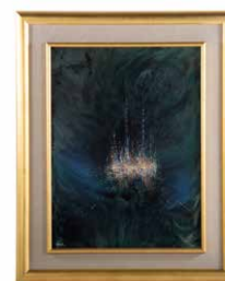
Leonardo M. Nierman. Untitled, oil on board

(Mexican, b. 1932). Oil on board, signed "Nierman" ll, 38 x 30 1/2 in., framed. Est. $1,000 - 2,000