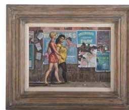
Joseph Sheppard. "Walk by the Poster Board," oil (American, b. 1930). Oil on masonite, signed "Sheppard" ll, sight size: 11 1/2 x 15 1/2 in., framed. Est. $1,000 - 2,000 Provenance: From the Estate of Jack Luskin, Baltimore, MD.