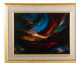
Leonardo M. Nierman. Untitled, oil on board

(Mexican, b. 1932). Oil on board, signed "Nierman" ll, 31 x 38 1/2 in., framed. Est. $1,000 - 2,000