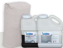
Bio-Cem™ MF self-leveling 1/8" polyurethane concrete