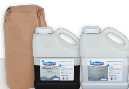
Bio-Cem™ MF mono-Floor™ 1/4" broadcast UC slurry