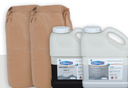
Bio-Cem™ CB 3/16" radius polyurethane concrete cove base