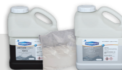
Bio-Cem TC™ polyurethane concrete topcoat matrix