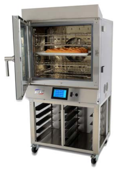
Shown with optional equipment stand (113-9062)