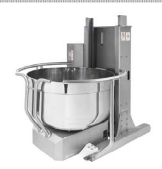
ETE145 (Shown with TAI100I)