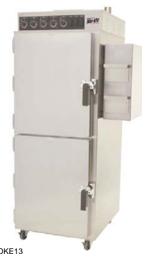
SMOKE13 shown with optional external smoke box