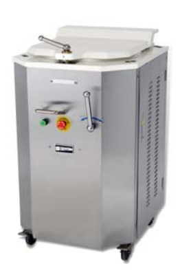
D20 Hydraulic Divider