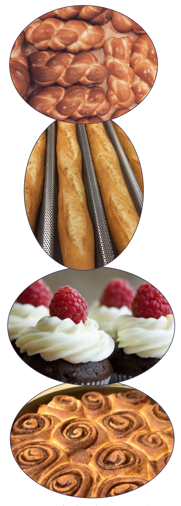
See product pages for pricing on parts & accessories.