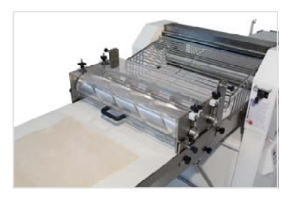
CPL001 Optional croissant cutter for LMA630