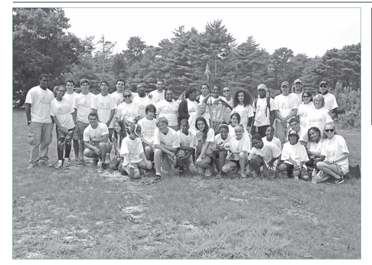
Members of the Boys and Girls Clubs of Dorchester and Nantucket joined together for a photo after their game at Nantucket Disc Golf on August 5. This game was made possible through the collaboration of the Under the Tree Foundation, both Boys and Girls clubs, and Nantucket Disc Golf.