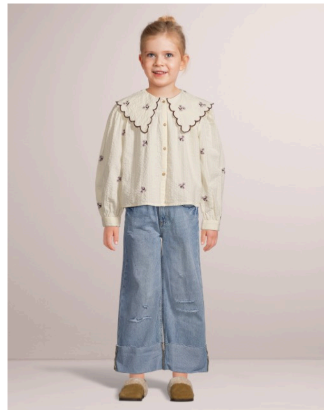
Flower bib shirt Chloé, Age 6