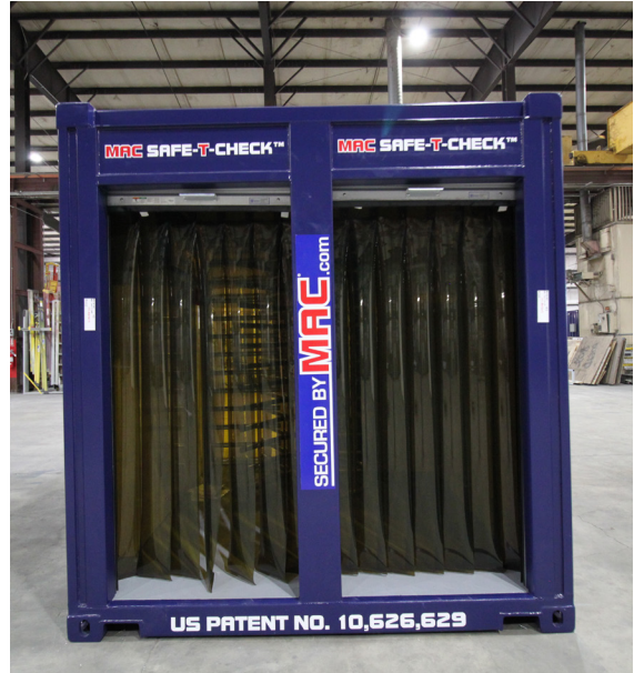
Model No. M1ST