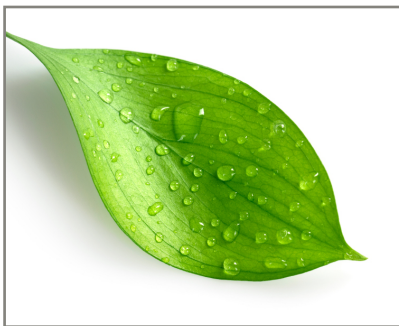
Good quality photo clean edges